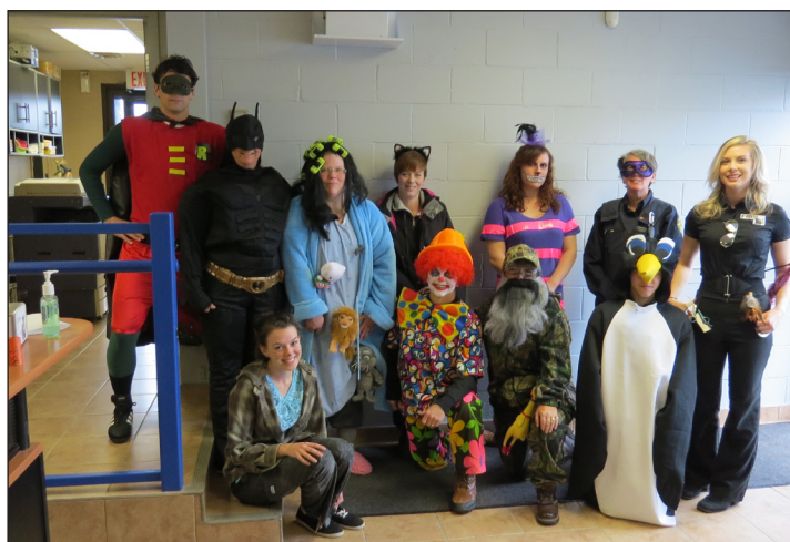
The entire team at PHS came in full costume for Halloween.