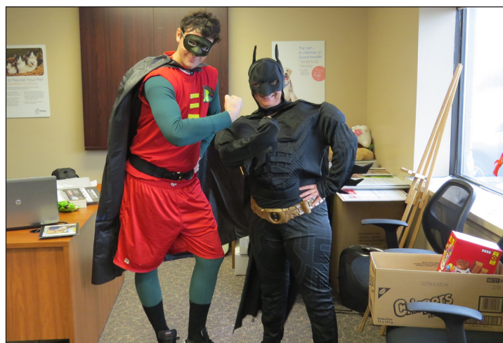
Batman and Robin made a special visit to the Humane Society.