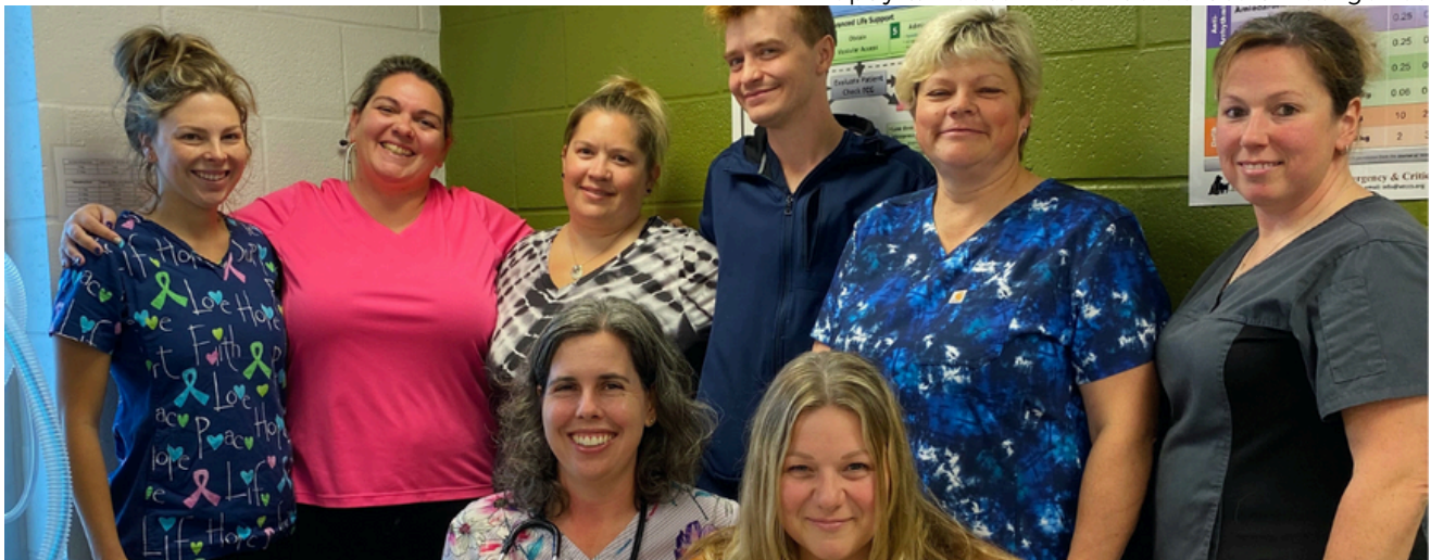
Spay & Neuter Team Celebrate 3K Surgeries

Our Peterborough Regional Spay/Neuter team plans to complete even more surgeries next year. Helping prevent pet overpopulation in our region and beyond!