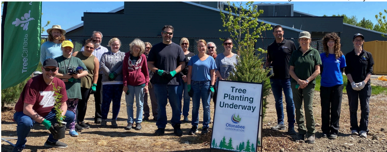
Tree Planting Event at PACC, May 2023

Kiwanis Club of Peterborough has supported PHS with gifts of $7,500 over the past two years. Their mission is “dedicated to improving the lives of youth in our community” and they have chosen to support PHS specifically with our youth programming and camps. Kiwanis sees value in teaching youth about care and compassion for animals in an attempt to foster growth with our next generation of animal ambassadors . Their support also allows us to subsidize fees to our kids camps for underserved or marginalized youth in our community who might not otherwise be able to attend.